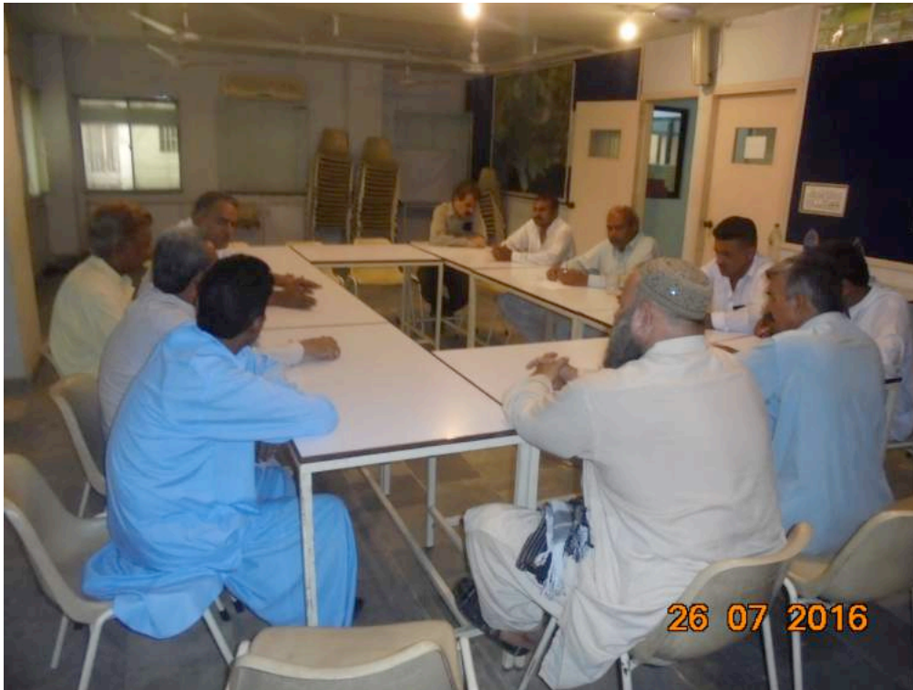
The community activists from the Network of the Communities along Gujjar Nullah are holding a meeting at URC to discuss forced eviction issues.