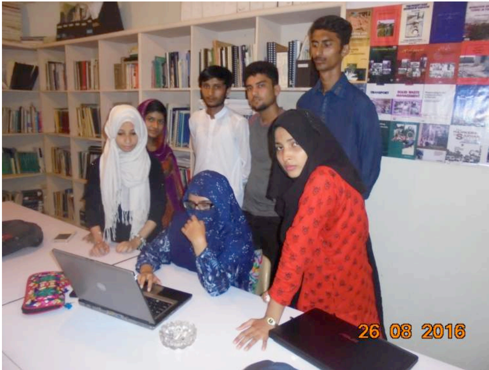
The students from Development Studies of the NED University are learning research tools and methods at URC office.