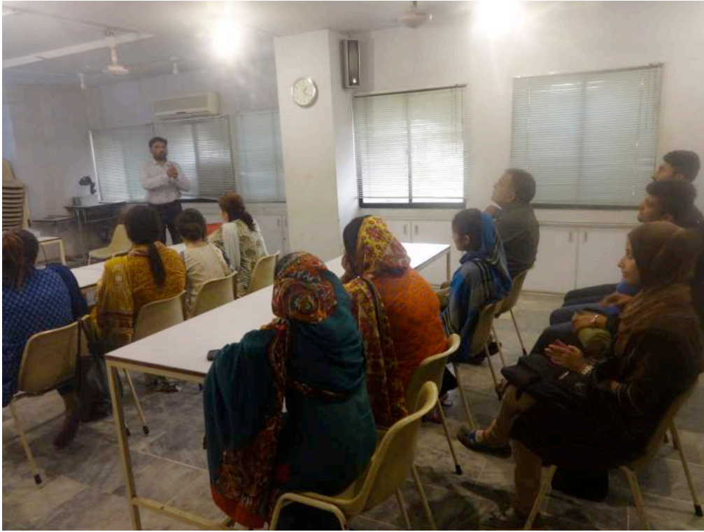
The students working with URC are taking part in an orientation discussion on public transport issues in Karachi