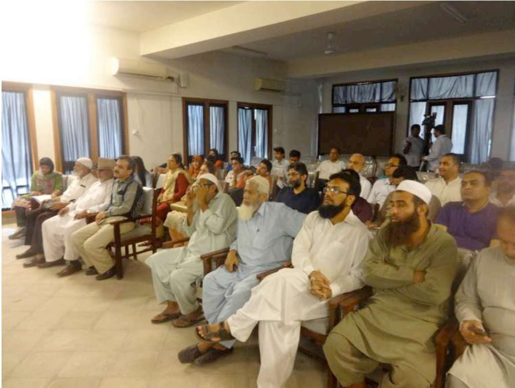
The stakeholders meeting of Bus Rapid Transit System (BRTS) held at Department of Architecture and Planning (DAP) of NED University. The meeting was jointly organized by URC and DAP.