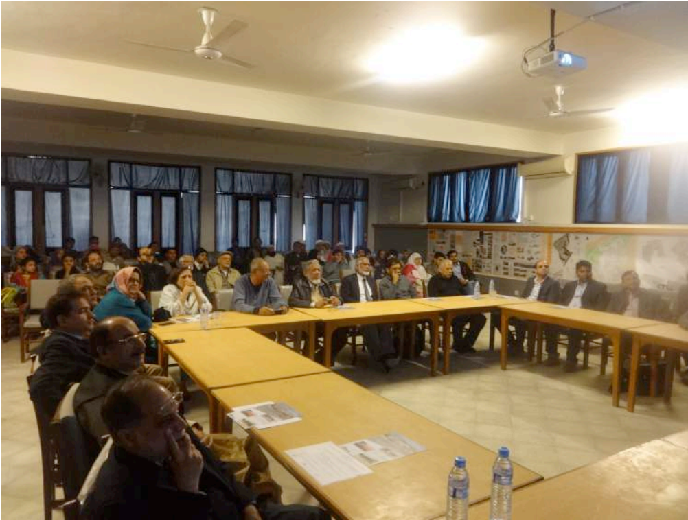
The forum on Affordable Housing Technology for the Low Income Groups held at Department of Architecture and Planning (DAP) NED University. The forum was jointly organized by DAP and URC.