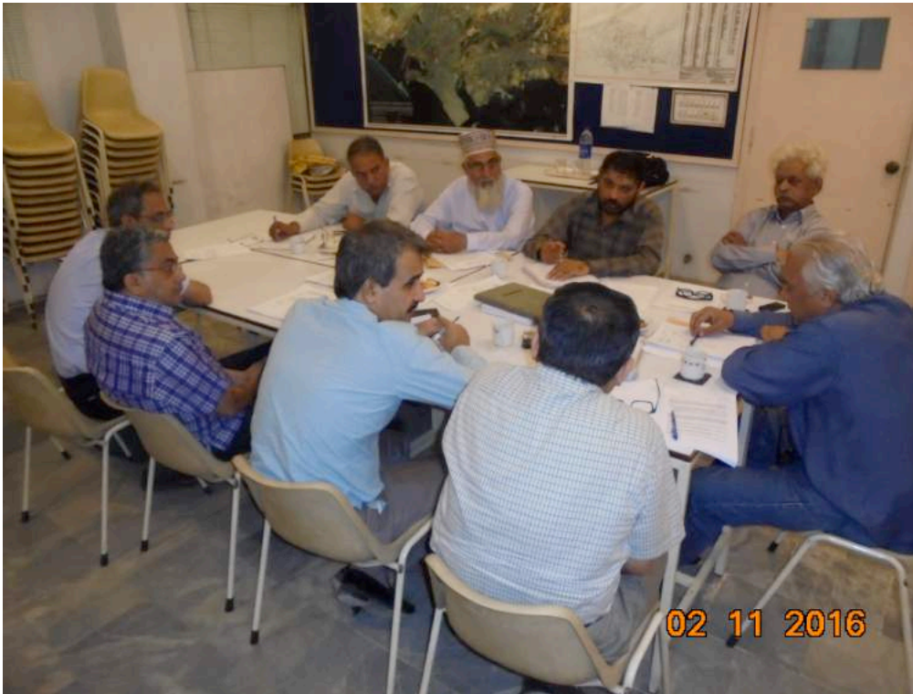
The URC Board Meeting is discussing and reviewing organization's activities