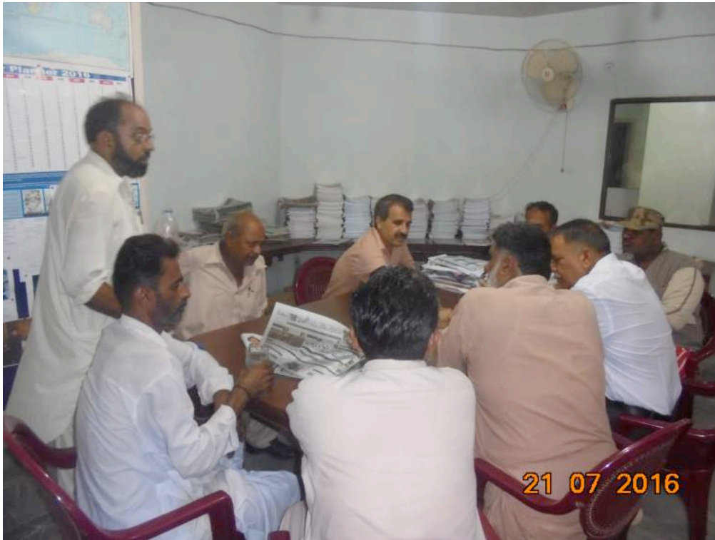
The community activists are holding a meeting at URC to discuss the issue of forced eviction and displacement of poor families in the city.