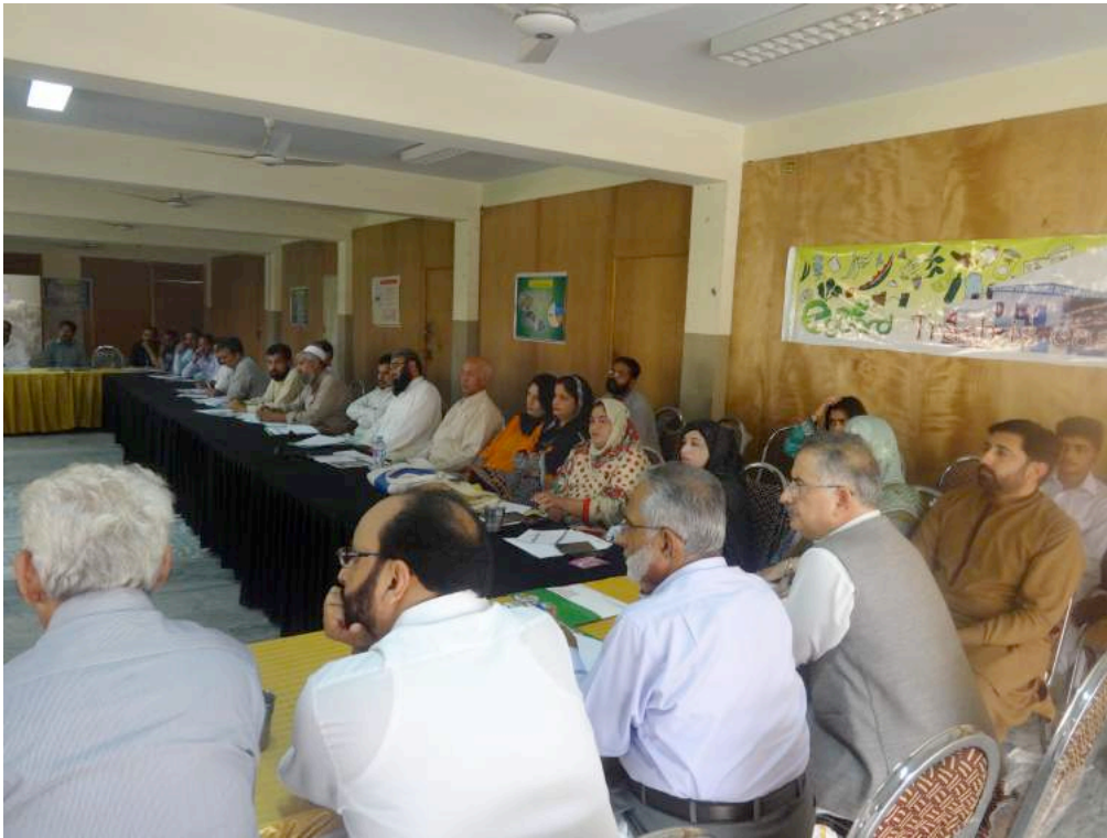
A view of Community Development Network (CDN) meeting. The meeting was held in Rawalpindi on 8 and 9 October 2016