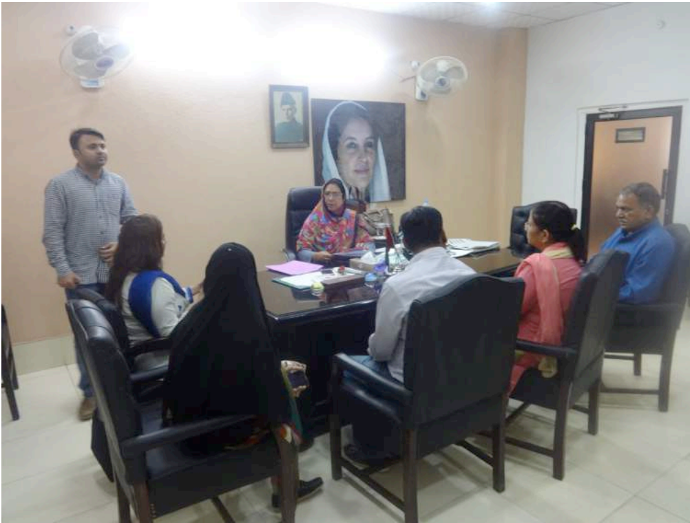
URC representatives are meeting with minister of human rights Sindh to share findings of survey on physical infrastructure of the KMC schools in Karachi