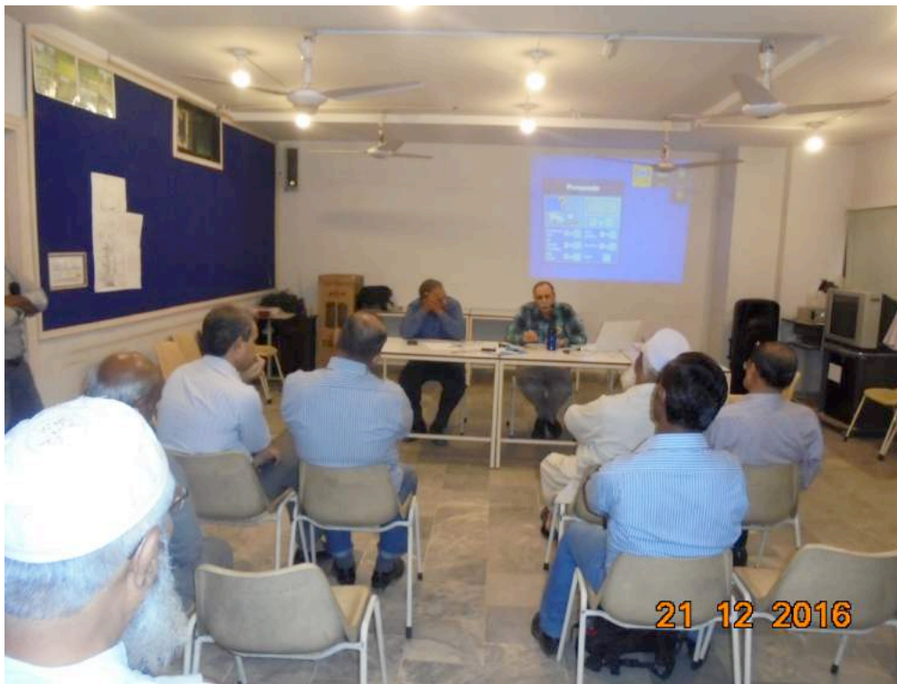
Forum on Public Safety at Work Places was held on 21st December 2016 at URC office.